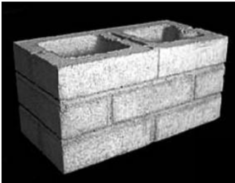
(Figure 2: Embossed Brick-Faced CMU Block)

The purpose of this investigation is to value engineer the building façade using embossed brick-faced CMU blocks. Brick-faced blocks provide aesthetics similar to that of brick veneer without incurring additional material and labor costs associated with assembly. An example of the proposed units can be seen in Figure 2.