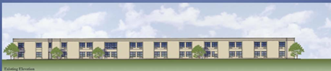
Existing Elevation Courtesy of RLPS Architects