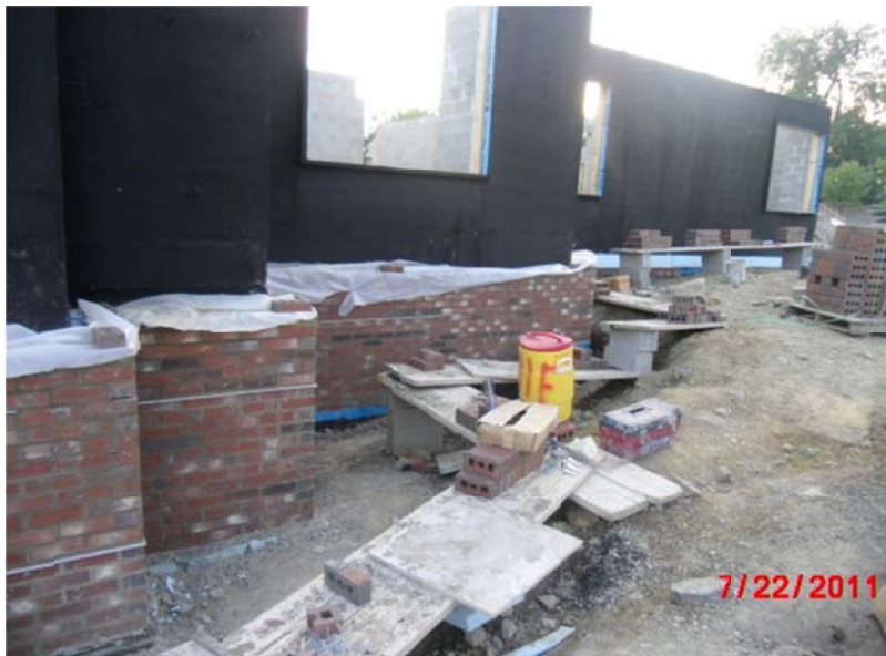
(Figure 1: Façade Irregularity)

Masonic Village at Sewickley's irregularly shaped façade has been identified as an exceptionally challenging and costly characteristic of the building. With numerous insets and protrusions around the perimeter, the building layout was simply not designed to be compatible with block construction. An example of this can be viewed in Figure 1. Considering measurements do not match up well with dimensions commonly used for masonry, the site generates an enormous amount of waste. Nearly every corner requires blocks to be cut at the ends of each row going up the building. Modifying blocks to fit proper dimensions not only adds cost in material waste but also in labor and manpower. This process has proven to become extremely time consuming and labor intensive. Making minor adjustments to wall dimensions has the potential to generate unprecedented cost savings. If dimensions are altered to matchup with standard CMU increments, there would be far less project cost associated with material waste, manpower, and time needed to perform work.