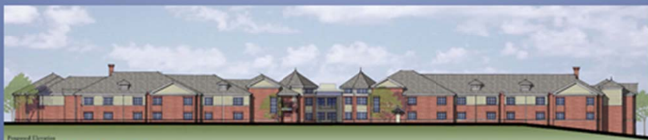
Proposed Elevation Courtesy of RLPS Architects